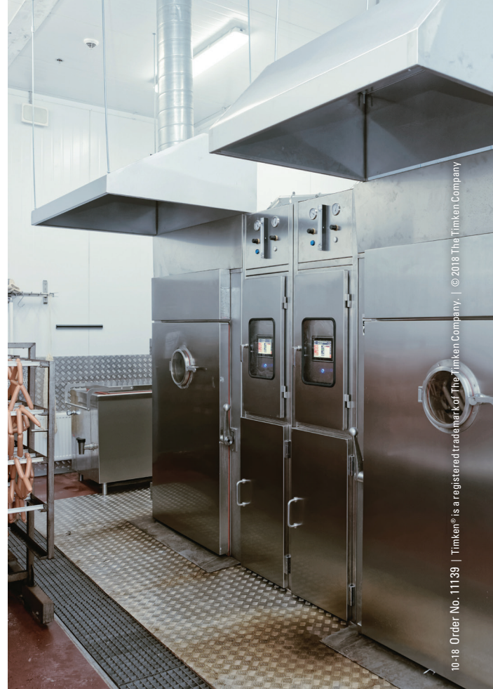
10-18 Order No. 111139 | Timken® is a registered trademark of The Timken Company. | ©2018 The Timken Company